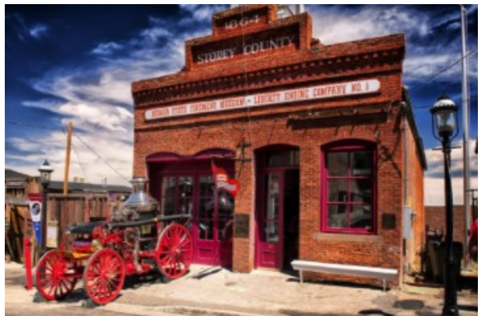
Museum a few years ago with restored and operational steamer out front.