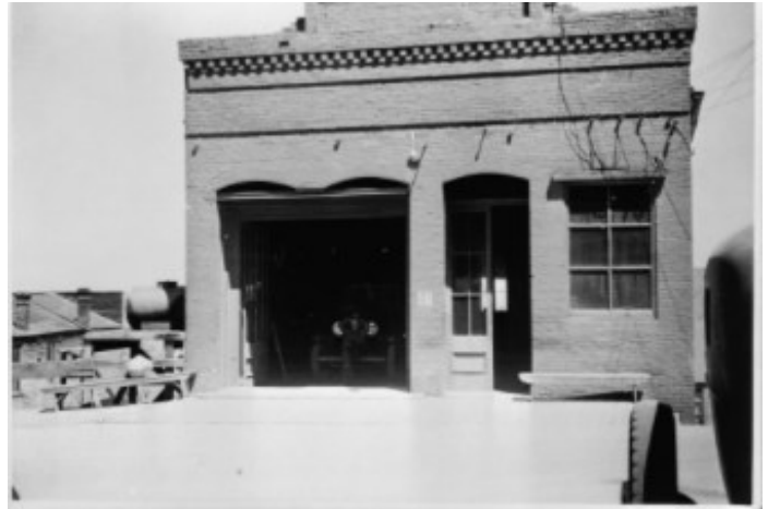
Fire Museum in 1938. Headlights show the 1929 Chevrolet fire truck, the first motorized apparatus in Virginia City.