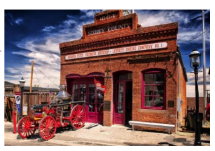
Museum a few years ago with restored and operational steamer out front.