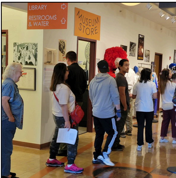
Above Photo: Visitors enjoying our changing gallery during the reception on Saturday, October 7, 2023.

The exhibit will be on display through January 27, 2024.