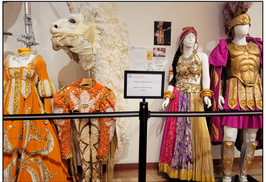
Above Photo: The latest exhibition in the NHS Changing Hallway Gallery on Hello Hollywood, Hello! , featuring costumes from Kiss Me Kate and Ben Hur .