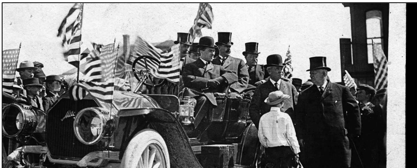
Above Photo: Colonel Teddy Roosevelt's visit to Reno, 1911.