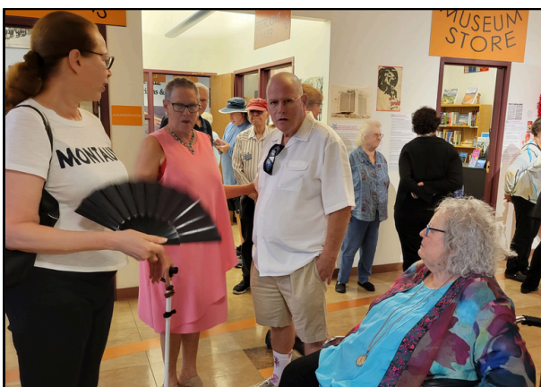
Below Photo: Several former HHH cast and crew members catching up during the reception.