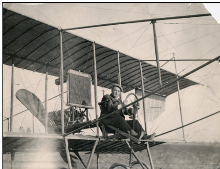
Above Photo: Frederick Joseph Wiseman, early aviator who participated in an early exhibition at the State Fairgrounds in Reno, October 1910.

That's all for now, thanks for taking a few minutes to catch up on what's happening with the Docent Council!