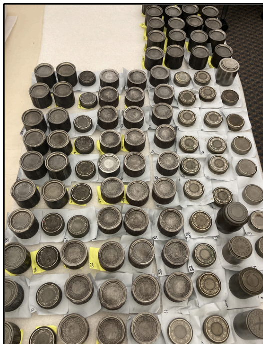
Above Photo: Group photo of chip molding cups and hobs