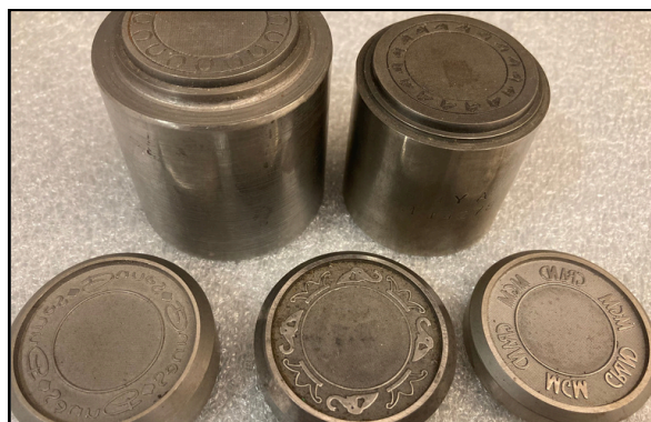
Below Photo: Pool ball mold set that weighs 950 lbs.